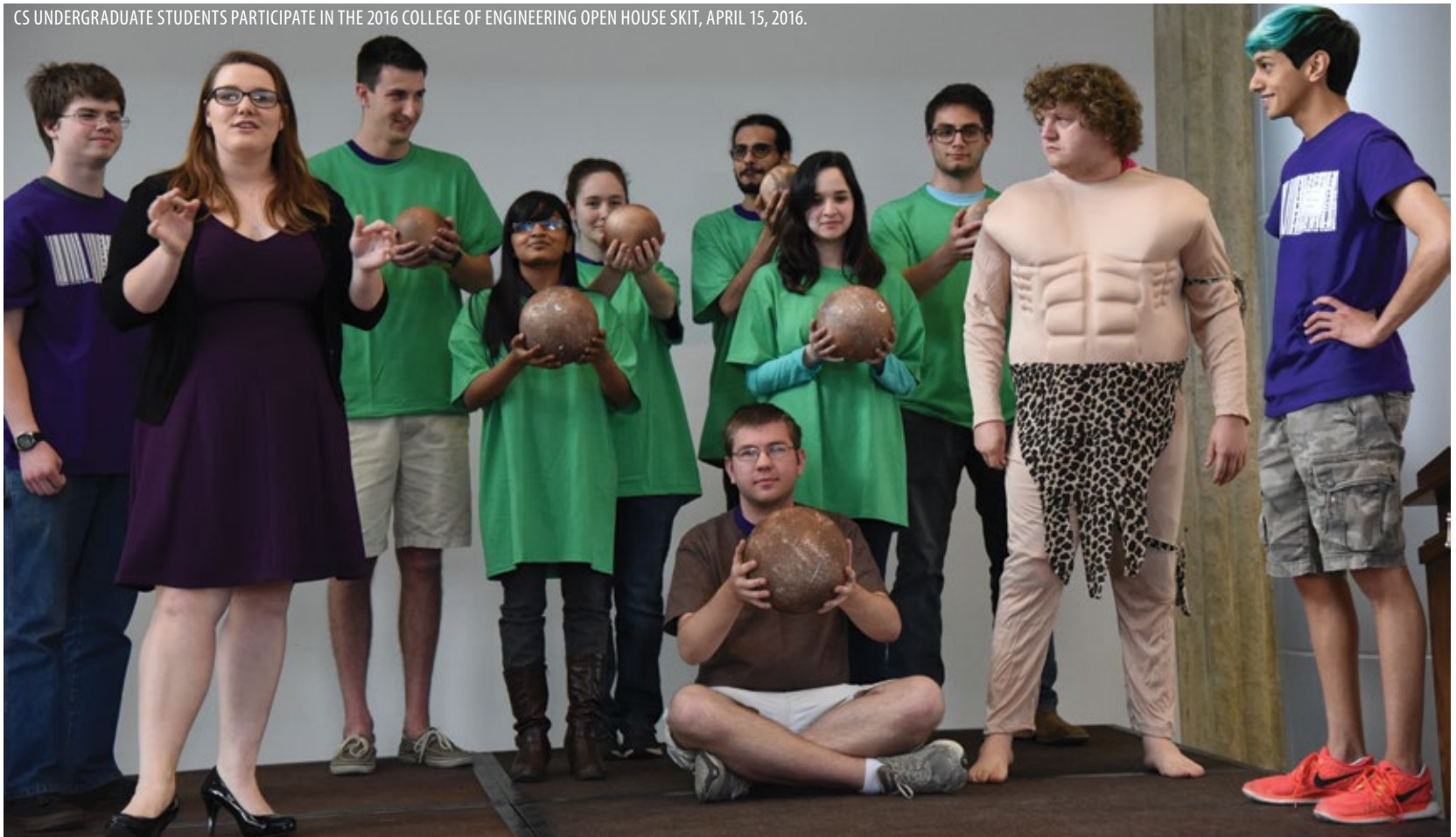
CS UNDERGRADUATE STUDENTS PARTICIPATE IN THE 2016 COLLEGE OF ENGINEERING OPEN HOUSE SKIT, APRIL 15, 2016.

Kansas State University prohibits discrimination on the basis of race, color, ethnicity, national origin, sex (including sexual harassment and sexual violence), sexual orientation, gender identity, religion, age, ancestry, disability, genetic information, military status, or veteran status, in the University's programs and activities as required by applicable laws and regulations. The person designated with responsibility for coordination of compliance efforts and receipt of inquiries concerning non-discrimination policies is the University's Title IX Coordinator: the Director of the Office of Institutional Equity, equity@k-state.edu , 103 Edwards Hall, Kansas State University, Manhattan, Kansas 66506, (785) 532-6277. The campus ADA Coordinator is the Director of Employee Relations, charlott@k-state.edu , who may be reached at 103 Edwards Hall, Kansas State University, Manhattan, Kansas 66506, (785) 532-6277. Revised July 7, 2015.