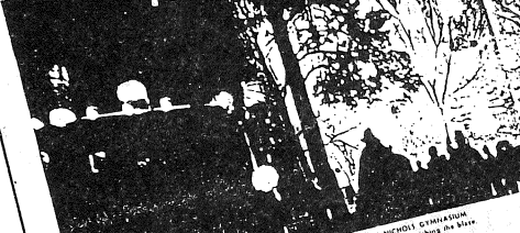
THE INVERSE BRIGHTNESS OF THE NICHOLS GYMNASIUM. Almost obscures the silhouette of spectators watching the blaze.

The fire broke out at 11:58 p.m. on Tuesday, Nov. 12, 1985, in the Nichols Hall building on the campus of Kansas State University. The fire was caused by a short circuit in the wiring of a television set in the room of a student. The fire spread rapidly, engulfing the building in flames. The fire department arrived at 12:05 a.m. and worked for several hours to contain the fire. The fire caused significant damage to the building, including the loss of the Nichols Gymnasium. The fire was the most serious fire in the history of the building. The fire was caused by a short circuit in the wiring of a television set in the room of a student. The fire spread rapidly, engulfing the building in flames. The fire department arrived at 12:05 a.m. and worked for several hours to contain the fire. The fire caused significant damage to the building, including the loss of the Nichols Gymnasium. The fire was the most serious fire in the history of the building.